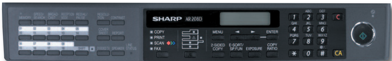
Shown with Super G3 Fax Kit Option installed